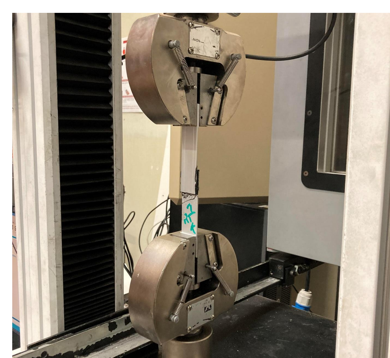
Figure 2 – Experimental setup for the vibrational data (Left) and Experimental setup for the tensile test of the 11 experimental samples (Right).