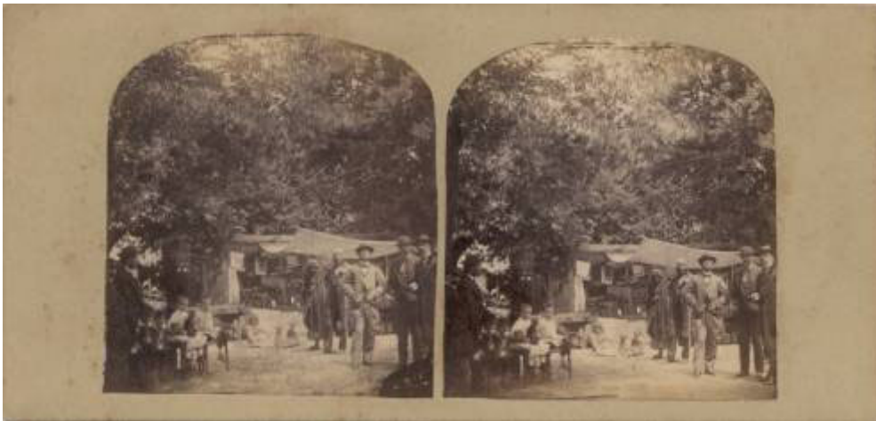
nn2 - Uncaptioned (early view of a popular celebration in the north of Portugal, possibly a fair of some sort) - Handwritten in the backside: 'Portugal – Scena do Minho – N.º 53'.