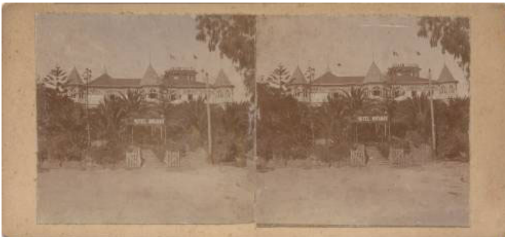
nn3 - Uncaptioned (Hotel Miramar) - Certainly a seaside hotel, possibly in a village with this name in the north of Portugal.