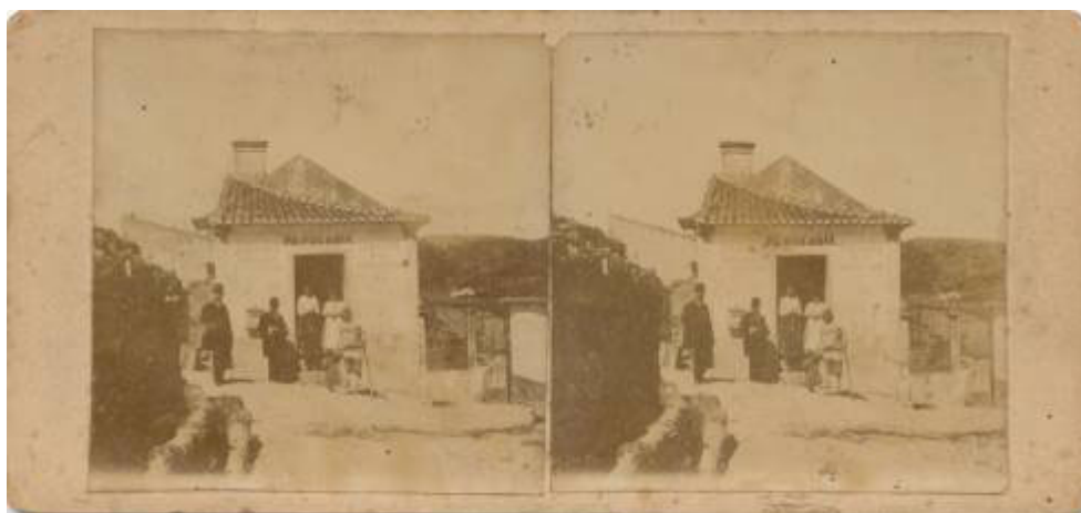
nn5 - Grocery store -