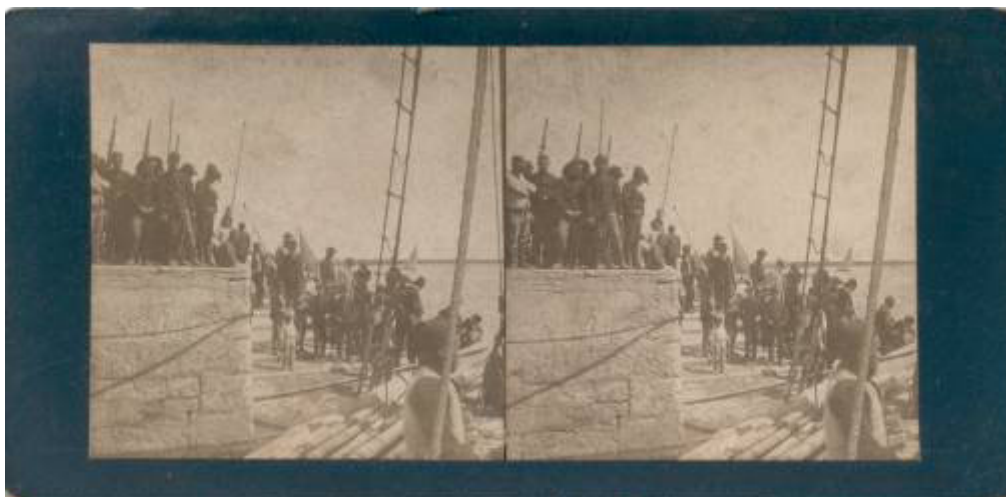
nn4 - Uncaptioned (people by what seems to be a riverside) -