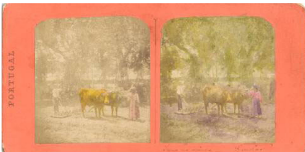
nn6 - (a rural scene poorly hand-painted) - Handwritten caption in the lower right at front: 'Scena no Minho — Gradar'.