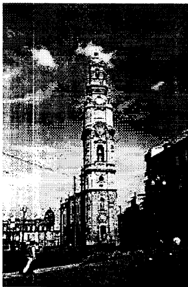
Fig. 1 – Clérigos' church belfry.

The Clérigos church (built between 1735 and 1748) is Porto's most proud Emblem. It is a baroque church designed by the Italian architect Niccolò Nasoni (1691-1773) which activity was prodigious in Porto judging by the numerous monuments edified by him. It is flanked to the west by a 76-meter high granite belfry that is today the main symbol of the town and dominates the entire downtown area due to its elevated location in a summit. The church is remarkable for its facade, the interior staircase of the presbytery, the liturgical decoration and the polychromatic rococo altarpiece by Manuel Porto. The elliptical plan shape of the nave shows its Italian influence. The Clérigos church is a national monument since 1910 (Fig. 1-3).