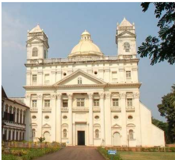
Figure 1. Our Lady of Divine Providence Church.